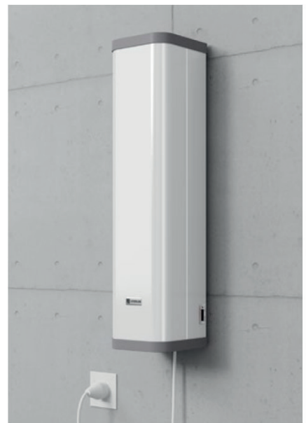
Version with cord (3 m)