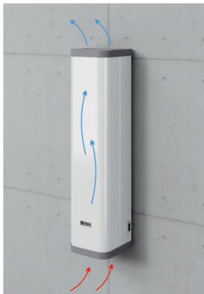
Airflow disinfection function

The design of the luminaire interior ensures perfect air flow and the highest level of disinfection efficiency. The Defender luminaire is equipped with protection against opening. Removing the top cover requires a hex key.